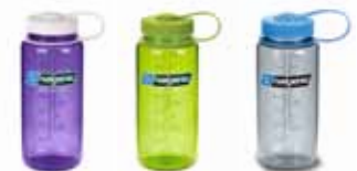
Purple 16 WM 682009-0573