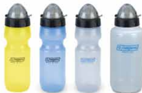
22 Oz. Yellow 2590-3022