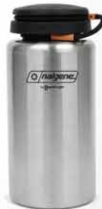
Standard 38oz 1778-1002

Our leakproof, odor proof, easy-to-clean stainless bottle is made from surgical grade 316 (18/10) stainless steel. The wide mouth accommodates ice cubes and water filtration devices.