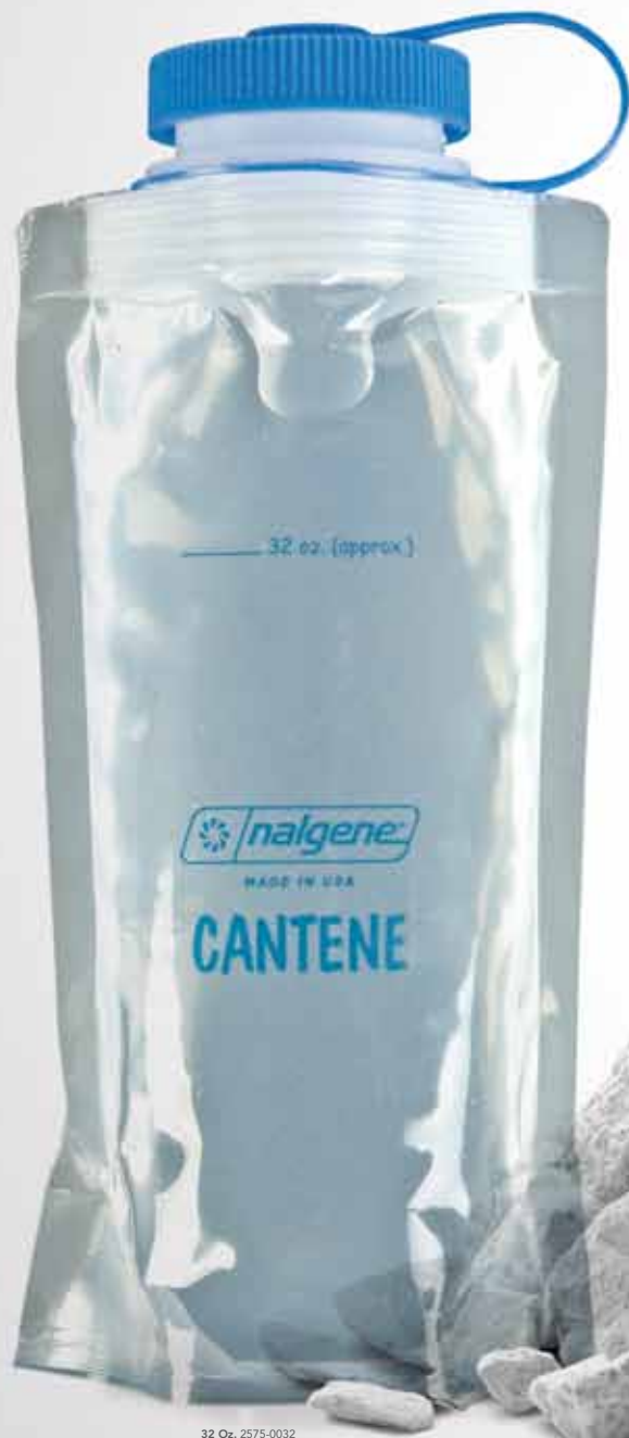
32 Oz. 2575-0032

Nalgene's super lightweight Cantene is the perfect travel companion. When fresh water isn't available at your camp, bring along a few Cantenes to keep things cooking. They can hold up to 96 ounces of liquid without taking up all the space in your bag. MADE IN THE USA.