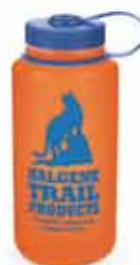
Orange 32WM Cat Logo 682007-0422