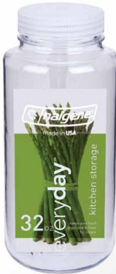
32 Oz. 682011-0082