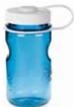
Blue Loop Top 2178-6012