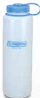
White 48WM 2179-0048