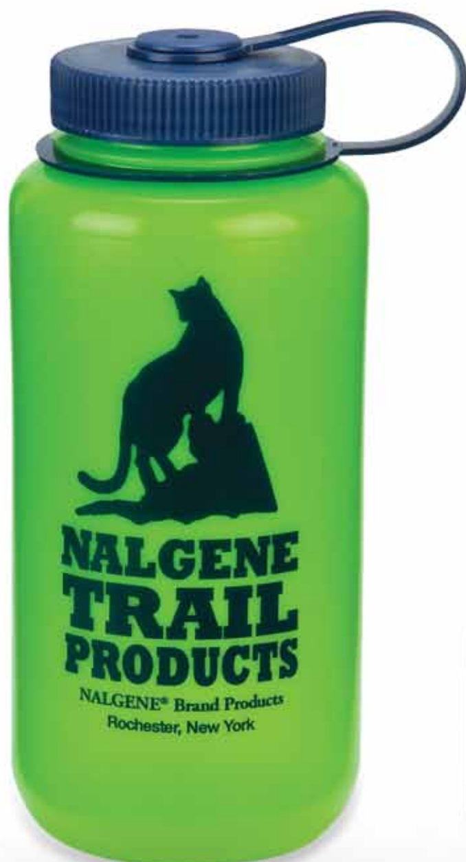
Green 32WM Cat Logo 2179-1032

Hit the trail with the first Nalgene bottle, created in the 1970s—a favorite among purists. This Ultralite bottle is available in both wide mouth (63mm) and narrow mouth (38mm). MADE IN THE USA.