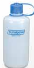
White 32NM 2079-0032