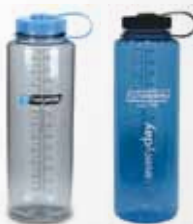
Gray 48 WM 2178-0048