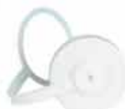
MIX & MATCH 18