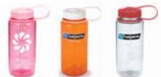
Pink 16 WM 2178-1216