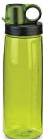
Spring Green 2590-7024