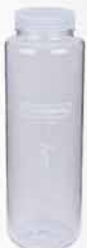
STORAGE & TRAVEL 34