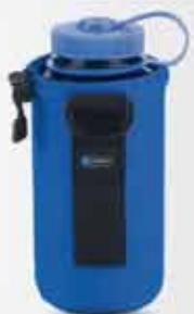
SLEEVES & CARRIERS 38