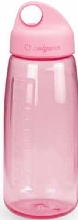
Pretty Pink 2190-1007