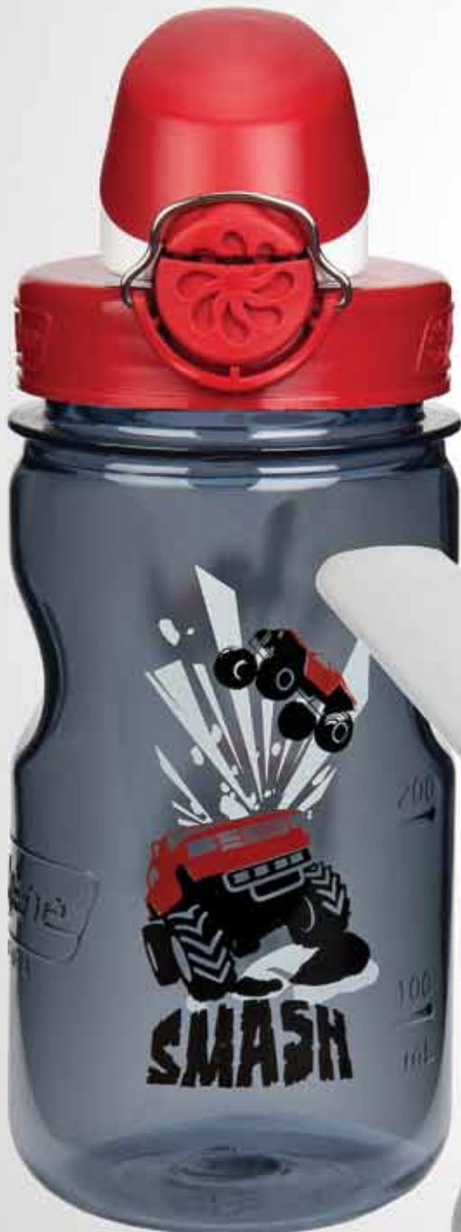
K OTF Gray Smash 1263-0001