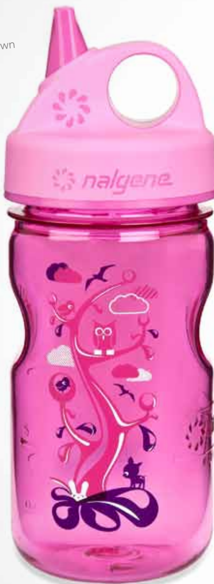
Pink Woodland 2182-1112