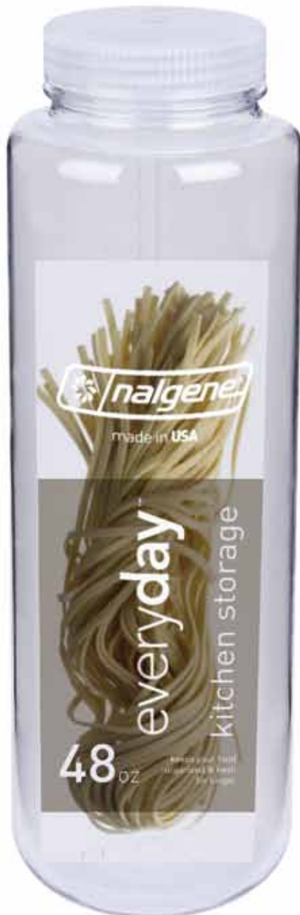
48 Oz. 682011-0080