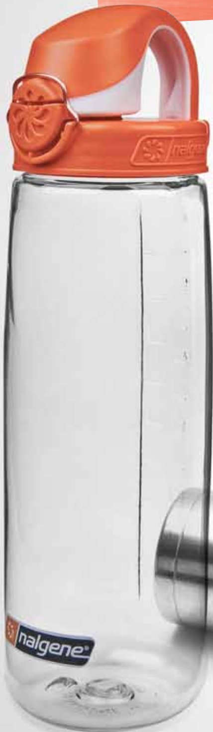
Clear / Roasted Orange cap 5565-3024

Take your workout and your water bottle to the next level with OTF (On-The-Fly). Only one hand's required to open the leak proof cap so you can multitask while working on your fitness. MADE IN THE USA.