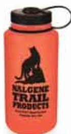
Red 32WM Cat Logo 682007-0421