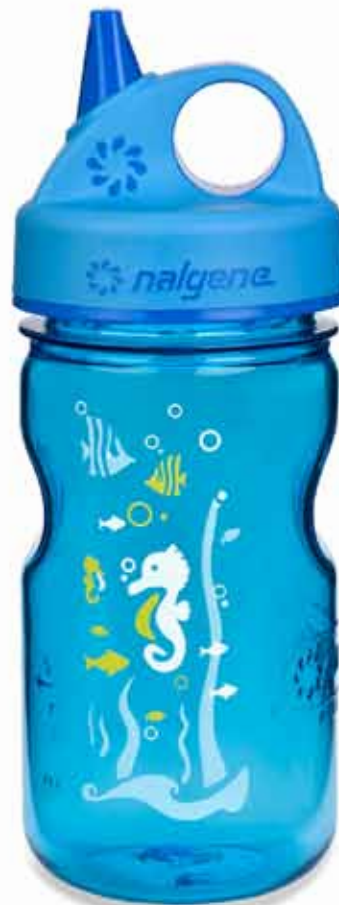
Blue Seahorse 2182-1412