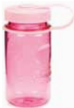
Pink Loop Top 2178-7012