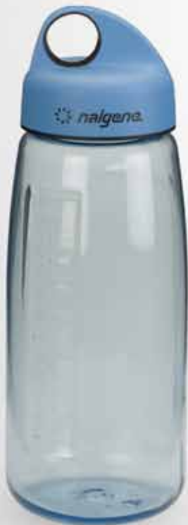
Tuxedo Blue 2190-1006