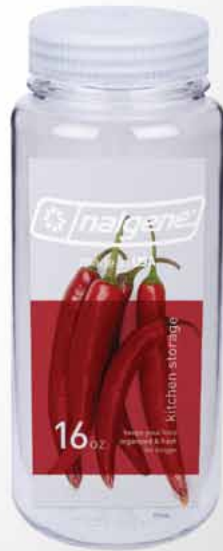
16 Oz. 682011-0081