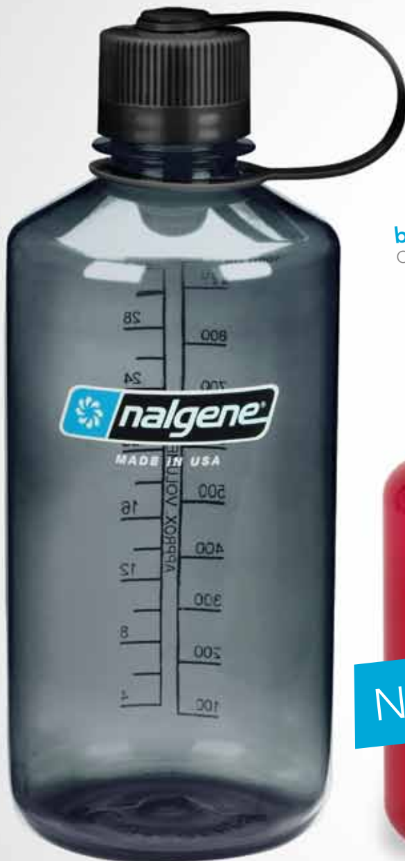
Gray 32 NM 2078-2027

bpa free Our Tritan material is bpa free.