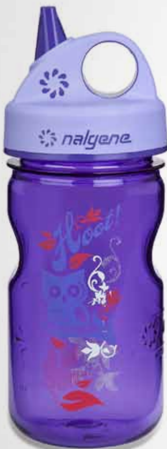
Purple Hoot 2182-1212

kid proof! Strong enough to be thrown from a moving minivan