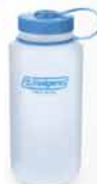
White 32WM 2179-0032