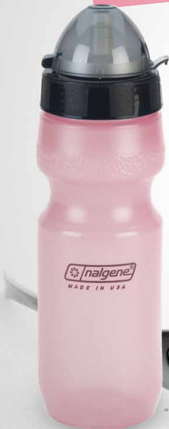
22 Oz. Pink 2590-2022