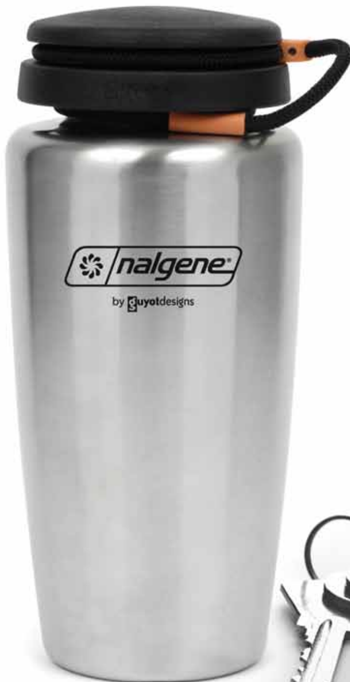
Backpacker 32oz 1778-1001